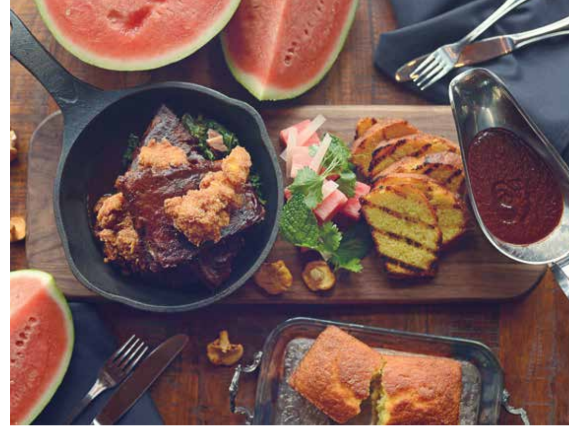
THIS PAGE: Share the enormous Block Party barbecue platter with friends and family at Wolf in the Fog. OPPOSITE PAGE: Charred Humboldt squid by Wolf in the Fog is carefully tenderised; the breathtaking landscape of Wickaninnish Inn

www.wickinn.com; www.longebeachnaturetours.com