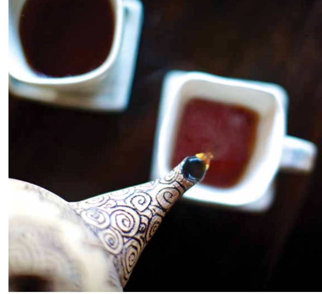
THIS PAGE: Sample a delectable cup of tea at Teafarm. OPPOSITE PAGE: Located on Cox Bay, Long Beach Lodge Resort offers an ideal location to catch waves

Just a few kilometres south of Tofino, this rustic resort includes 41 guest rooms in the main lodge along with 20 cottages, perfect for larger parties or couples who require more privacy. Rooms here are warm and inviting, with Douglas fir furniture and just a few simple decorative touches – like a framed grey wolf print and underwater whale-watching art prints. The Judith Jackson toiletries are divine – the invigorating citresse shampoo and juniper, basil and sage shower gel each have aromatherapy benefits, as do the soothing bergamot bath salts.